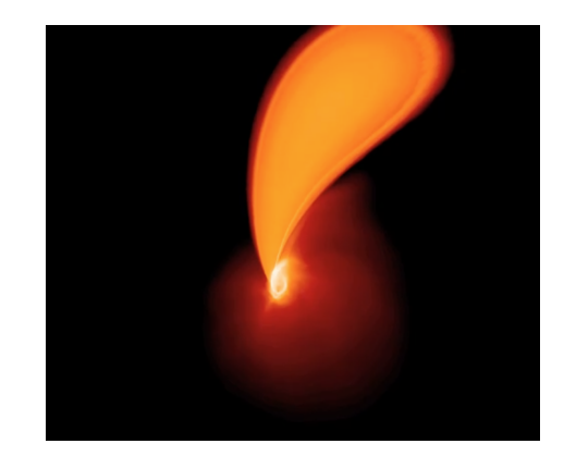
Figure 3: A white dwarf that entered very deeply into the tidal radius of an intermediate mass black hole. The white dwarf has been disrupted and thereby underwent substantial burning. Approximately half of the white dwarf is bound to the black, falling towards it and thereby building up an accretion disk.

a critical distance which is called the "tidal radius". The deformation of a white dwarf star that passes just outside the tidal radius of an "intermediate mass black hole" with 1000 times the mass of our Sun is shown in Fig. 2 \HLRNref{rosswog09}. In extreme cases where a white dwarf passes very deeply inside the tidal radius, the tidal forces of the black hole can crush the star so strongly that a thermonuclear explosion is triggered. Such a case is shown in Fig. 3 (from \HLRNref{rosswog09}).